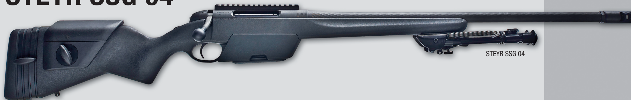
STEYR SSG 04