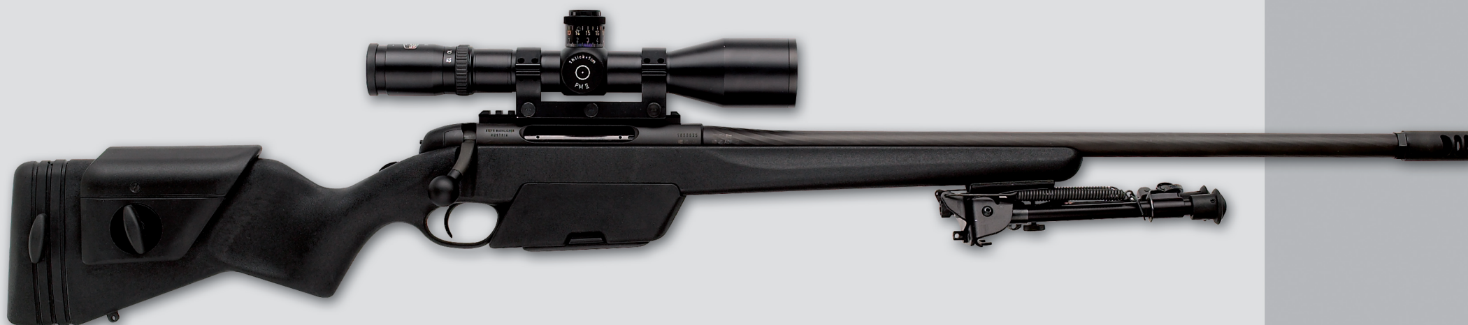
STEYR SSG 04

The new STEYR SSG 04 has been specially designed to serve law enforcement applications. It is built on the proven SBS system and features a heavy hammer-forged barrel with muzzle brake, hi-capacity 10-round magazine, Picatinny rail (Mil. Std. 1913 rail), bipod, a newly developed outstanding trigger and a fully adjustable butt stock.