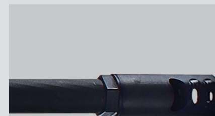
Match-barrel with new designed muzzle brake