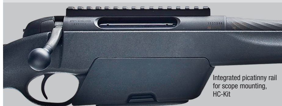
Integrated picatinny rail for scope mounting, HC-Kit